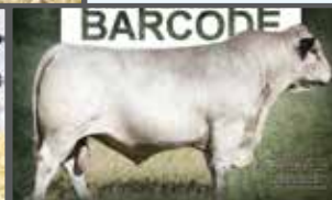
FULL SIBLING: NOTTA 101Y BARCODE 113B