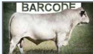
3R PROGENY: NOTTA 101Y BARCODE 113B