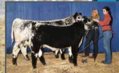
RESERVE SENIOR FEMALE AGRIBITION 2019 RAVENWORTH LIGHTNING LADY 120C WITH RAVENWORTH STETSON 112G