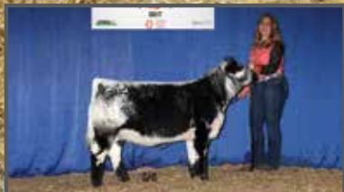
FULL SIBLING: RAVENWORTH WILLOW 134D