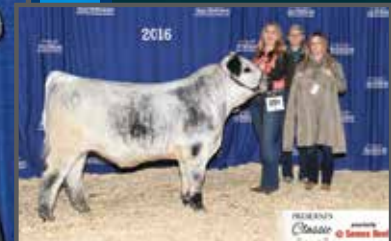
SIRE OF EMBRYOS: RAVENWORTH LEGENDARY 101D