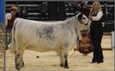
EMBRYOS FULL SIBLING: RAVENWORTH NORTHERN STAR 127F