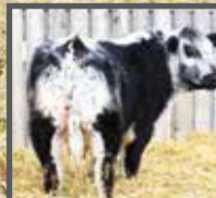
NOTTA 101Y LISTEN IN 369G