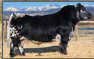
SIRE: NOTTA 1B HAWKEYE 444E

This genetic package has the look and style you would expect out of this combination.