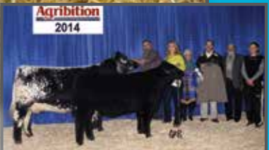
DAM: NOTTA 26T JANETTE 3W