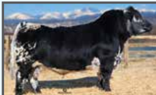
SIRE: NOTTA 1B HAWKEYE 444E