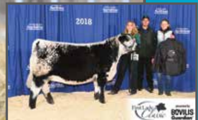
RAVENWORTH ACADIA 107E CO-OWNED WITH BELOW SEA LEVEL FIRST LADY BREED CHAMPION 2018 FULL SIBLING TO RAVENWORTH OBSESSION 101G