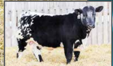
NOTTA 444E HIGH PROFILE 395G