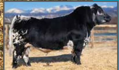
SIRE: NOTTA 1B HAWKEYE 444E