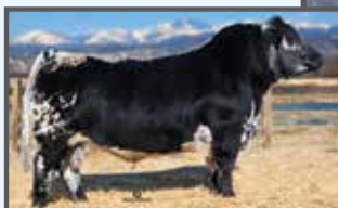
SIRE: NOTTA 1B HAWKEYE 444E