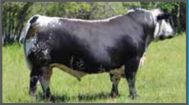
SIRE: RAVENWORTH INVICTUS 103C