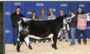
FULL SIBLING: NOTTA 101Y CADENCE 213C

No surprise here, this combination just keeps on working!!