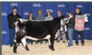
3R PROGENY: NOTTA 101Y CADENCE 213C